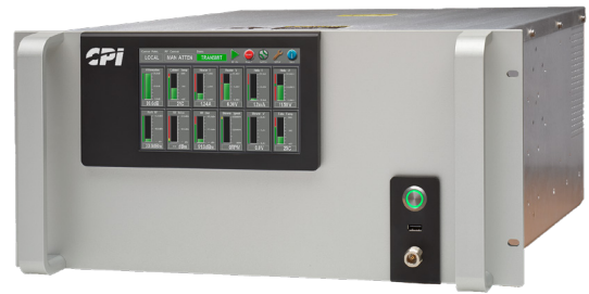
CPI 750 W C-band TWTA, Model T5CI